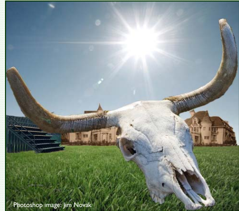
Photoshop image: Jim Novak