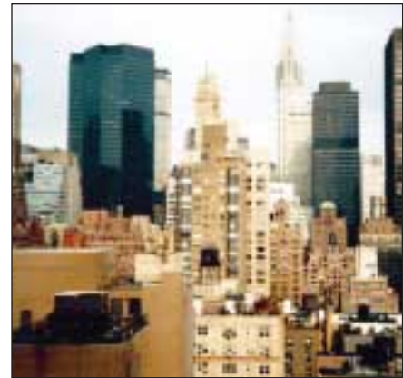
LAND USE AND URBANIZATION

Industrialization, urbanization, economic expansion, land use, development and even preservation all can contribute to the potential for a global water crisis.