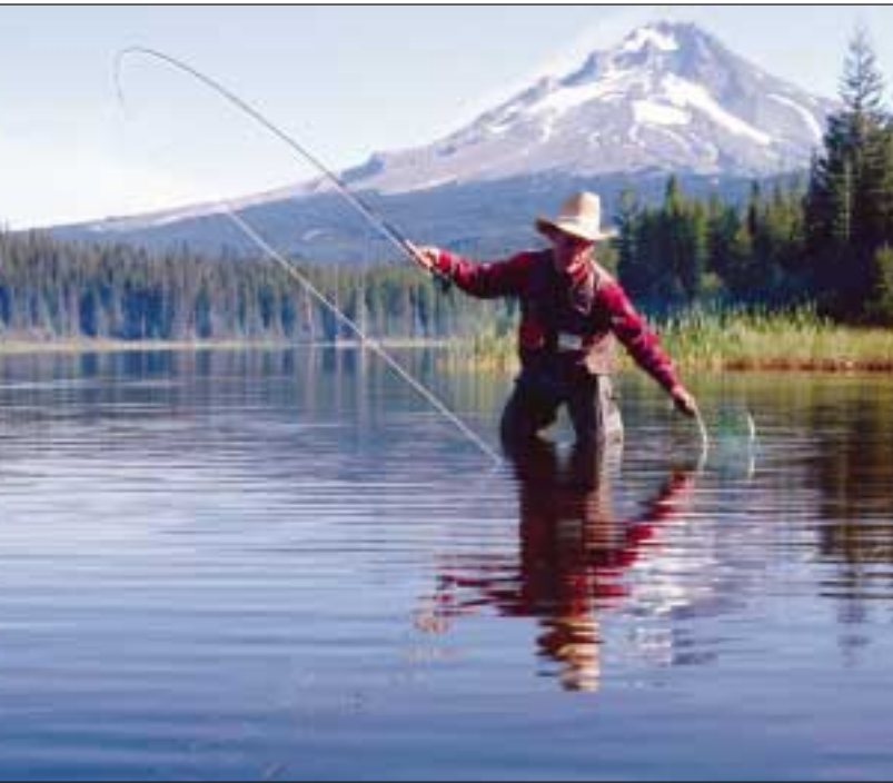
Fish and wildlife preservation, as well as water-related sports activities such as boating and rafting, have in many instances required greater stream inflows of clean water than was previously considered necessary.