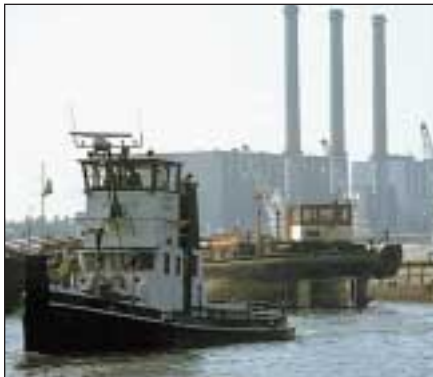
INDUSTRIALIZATION AND POLLUTION

The problems and solutions associated with increasing population, pollution and a diminishing supply of usable water cannot be viewed in isolation.