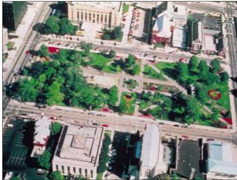
We need to think about how much of the globe we can cover with asphalt, cement and roofing materials, which impede the natural flow and recharging of our water supply and create energy-intensive heat islands. Photo: some communities are helping to alleviate heat islands with landscaping.

Clearly there are no simple or one-size-fits-all solutions. But perhaps new thinking on the part of water-policy decision-makers, scientists, technicians and even the general public can reveal how we can use the world's 1 percent supply of fresh water more wisely so that future populations, regardless of numbers, can live comfortably. Perhaps we can even develop ways to increase the 1 percent figure without harming the environment. 💧